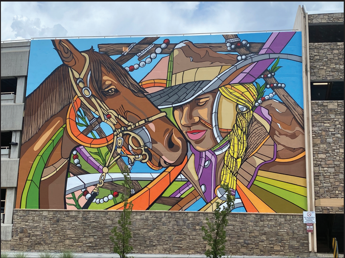
Mrs. Rodeo, 40' x 60,' acrylic on concrete, Ogden, UT, 2021