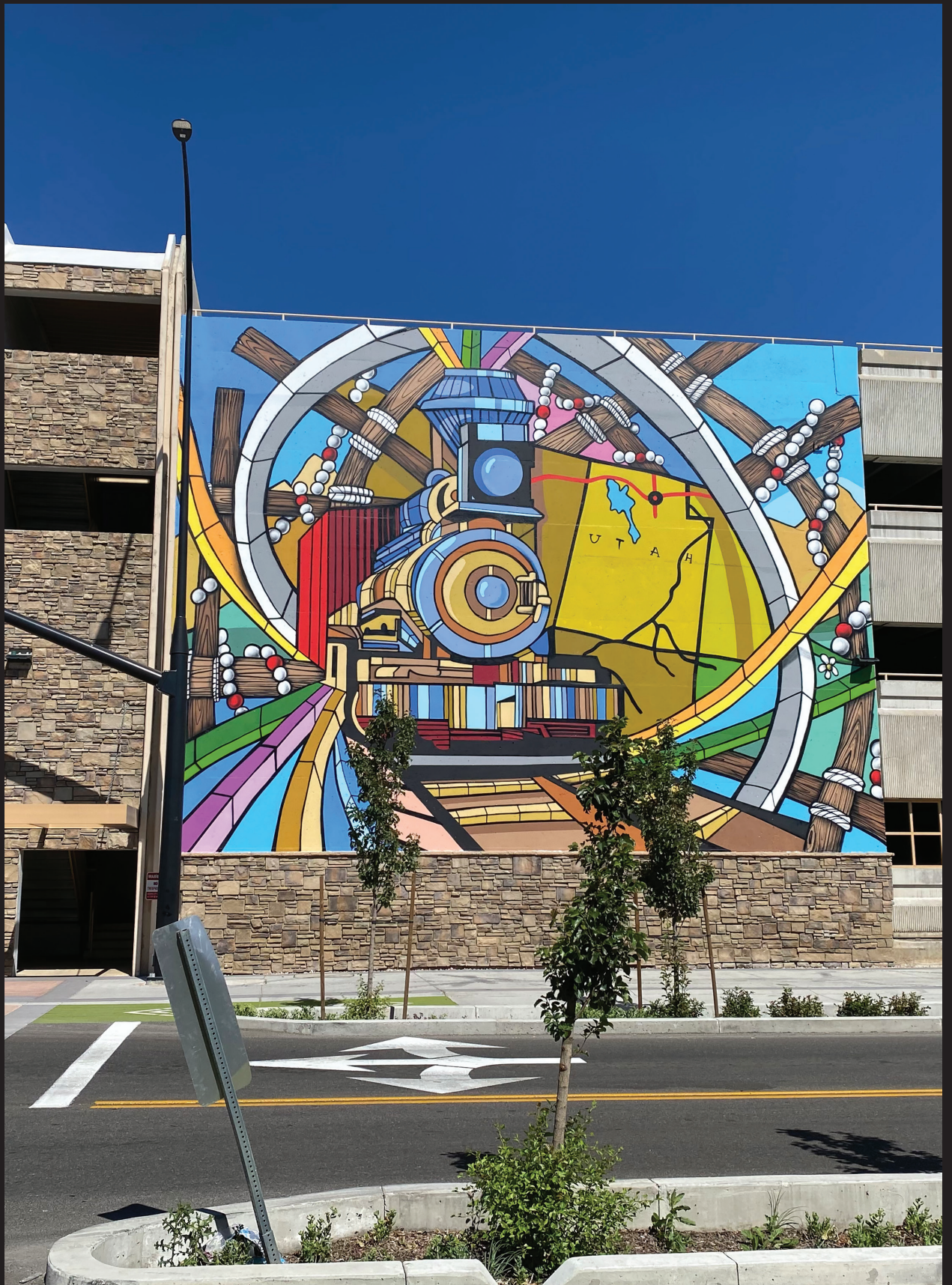
La Union , 40' x 50', acrylic on concrete, Ogden, UT, 2021