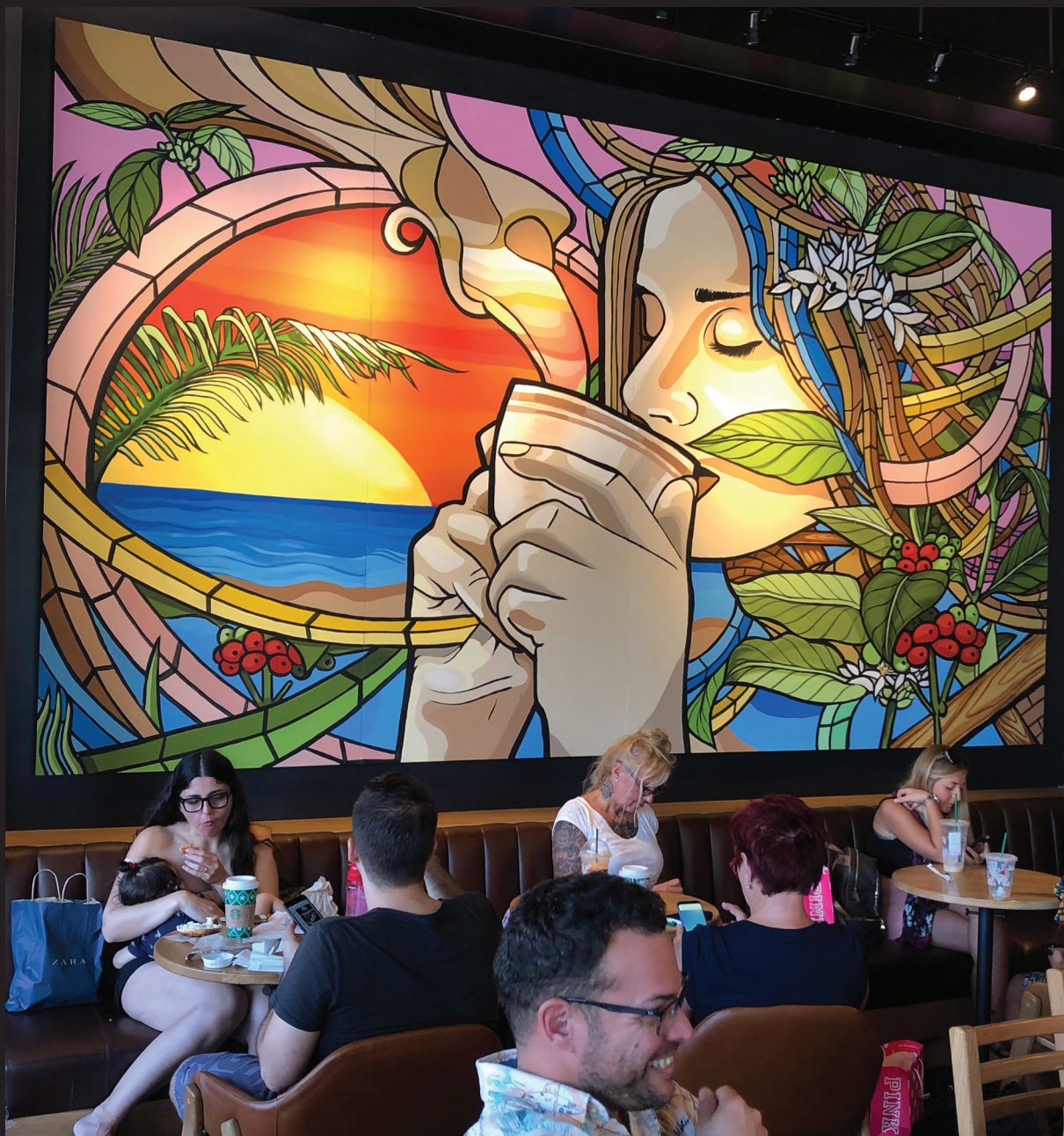
Aroma A Café , 8' x 12,' spray paint on wood, Miami Beach, FL, 2018