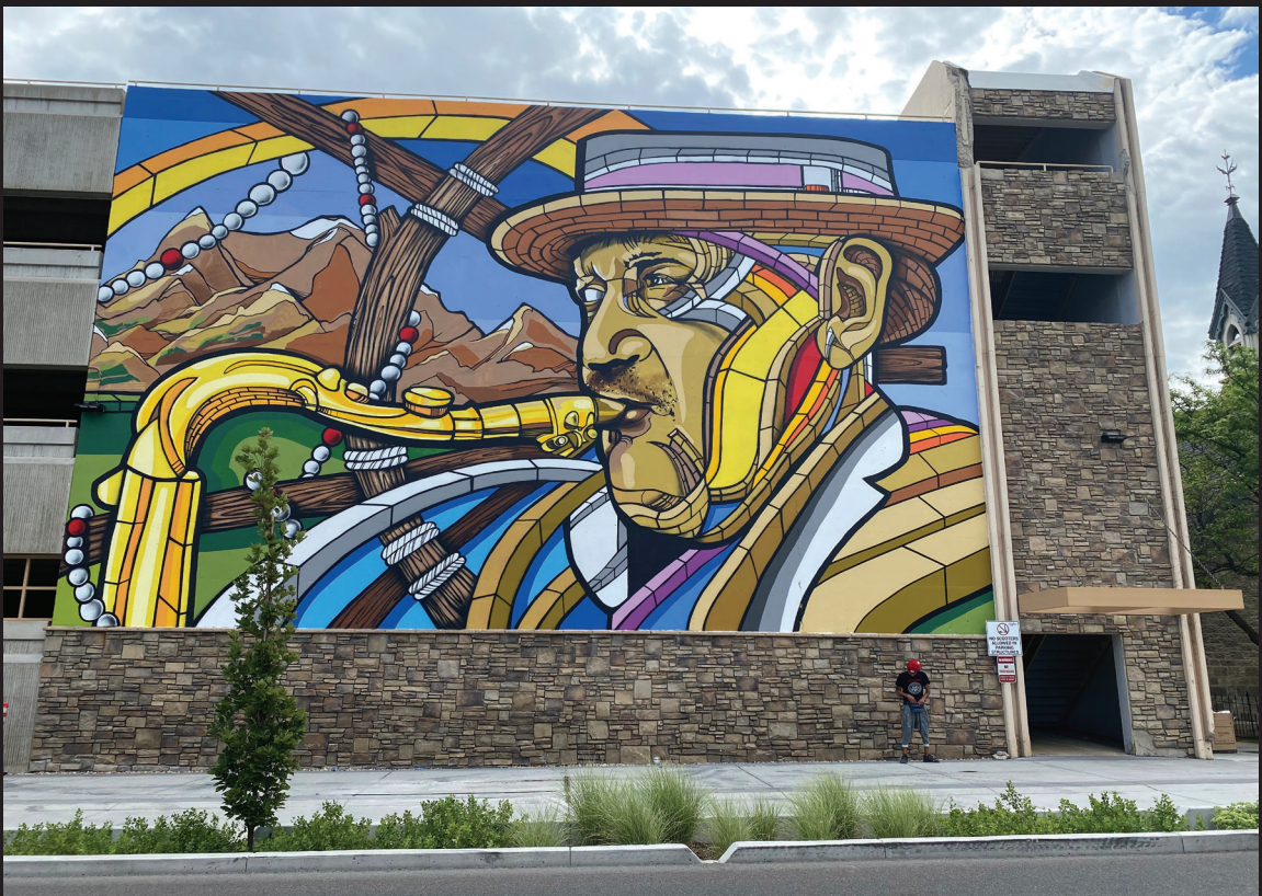
Joe McQueen, 40' x 60,' acrylic on concrete, Ogden, UT, 2021