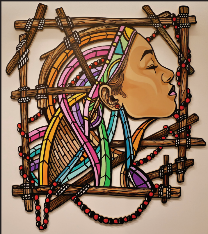
Aire , 94" x 90," acrylic on laser cut wood, Orlando, FL, 2020