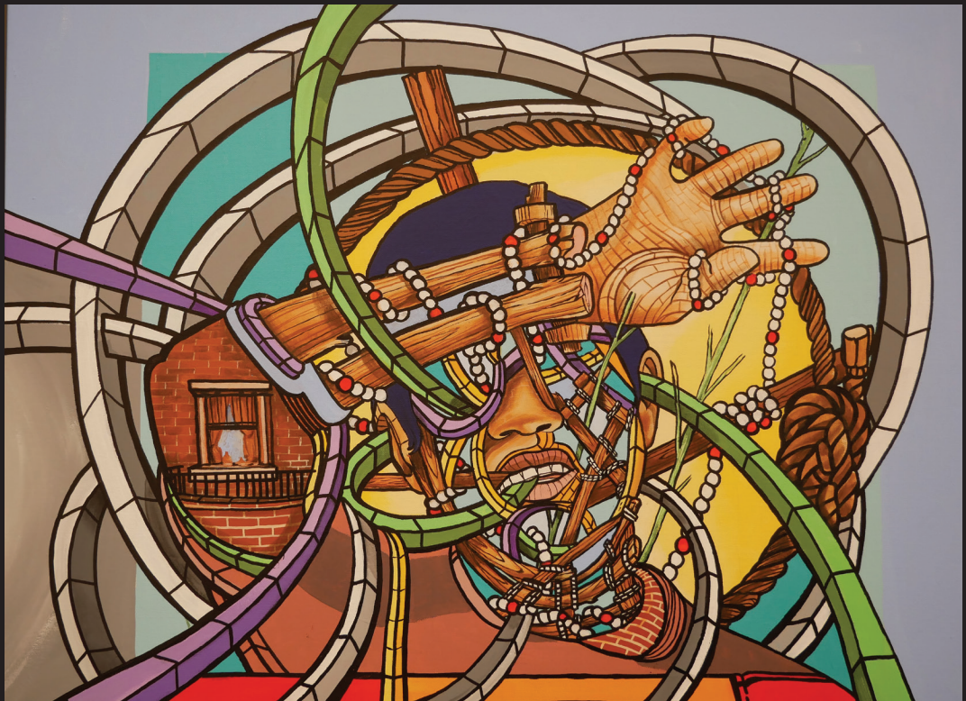
La Luz por la Ventana , 32" x 24," acrylic on canvas, Orlando, FL, 2019