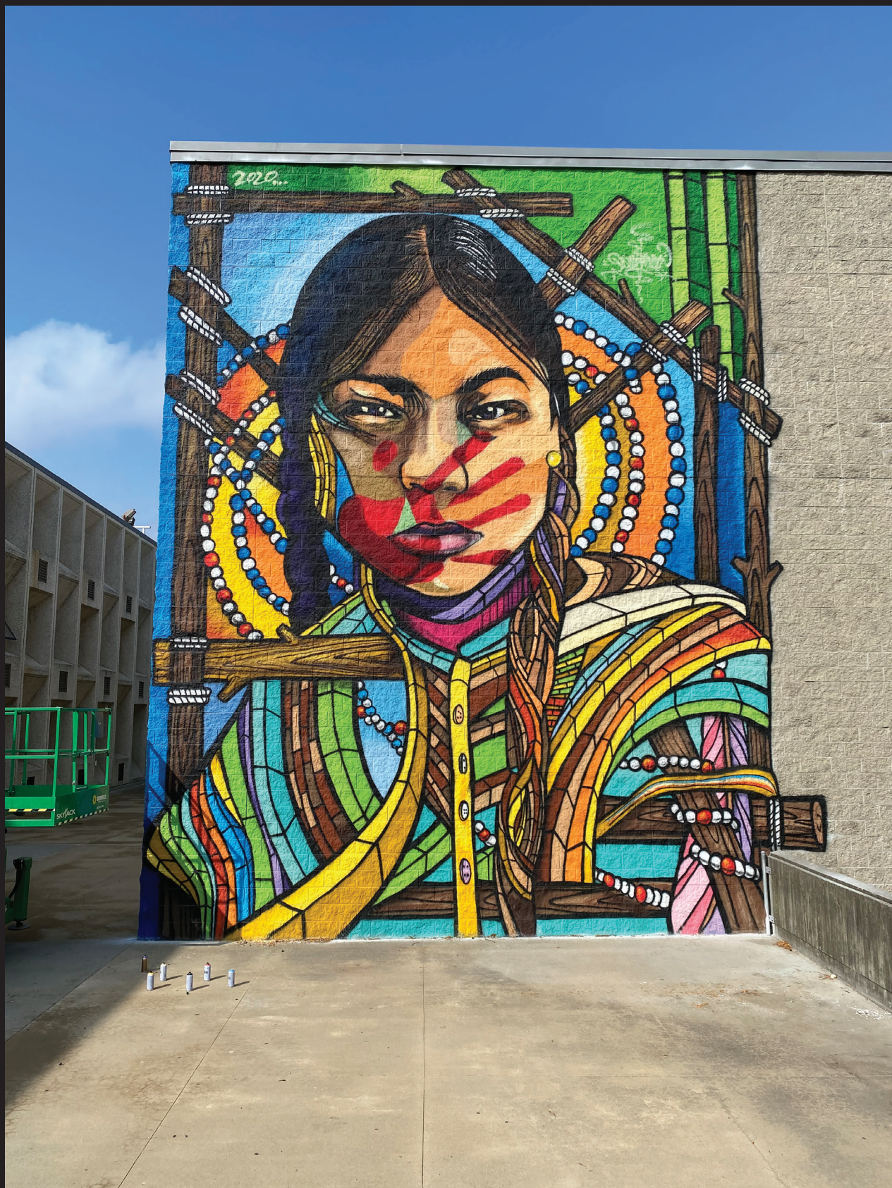
Sangre Indigena , 40' x 30,' spray paint on concrete, Roxbury, MA, 2020