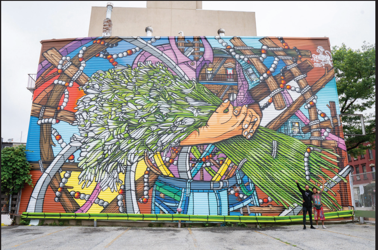
Olor a Azucenas, El Perfume Del Barrio, 30' x 50,' spray paint on vinyl, Brooklyn, NY, 2019