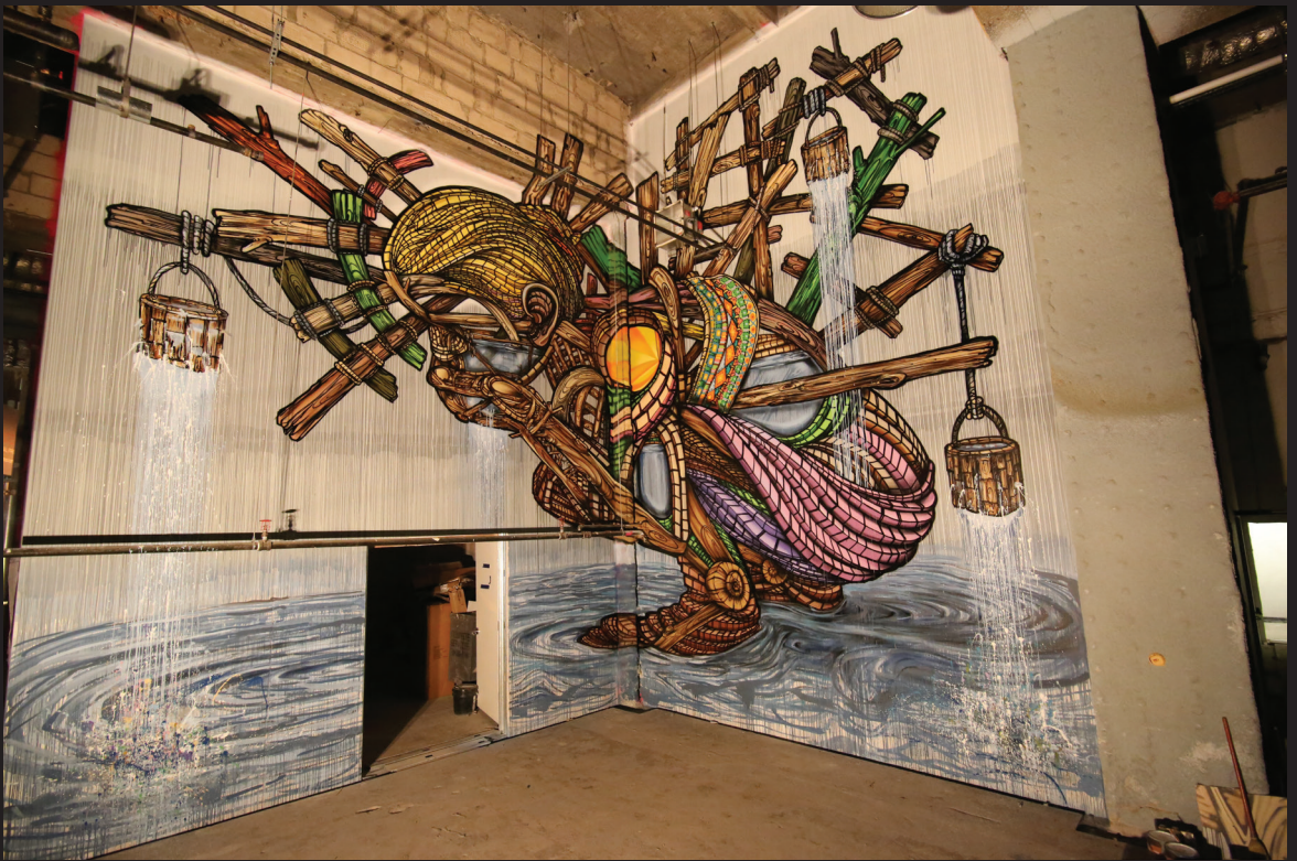
3/4 of Life = Water , 23' x 36,' spray paint on drywall, New York, NY, 2014