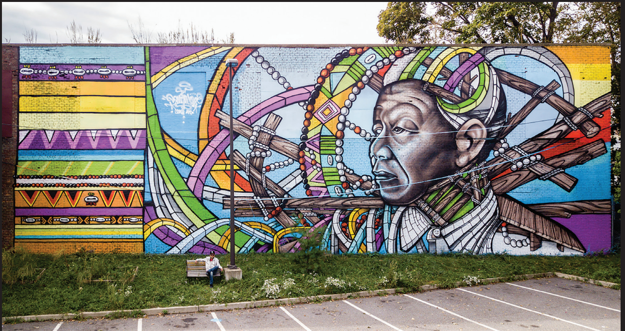
Nelson Mandela, 30' x 80,' spray paint on brick, Grove Hall, Boston, 2017