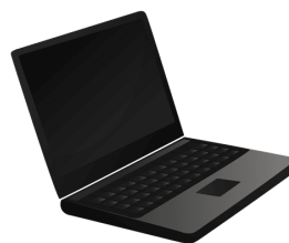
Laptops (on, fully charged)