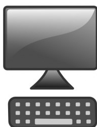
Monitors (LCD, sleep)