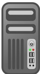
Desktop Computers (on, idle)