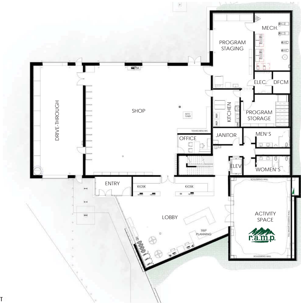
LEVEL 1 WEBER STATE UNIVERSIT