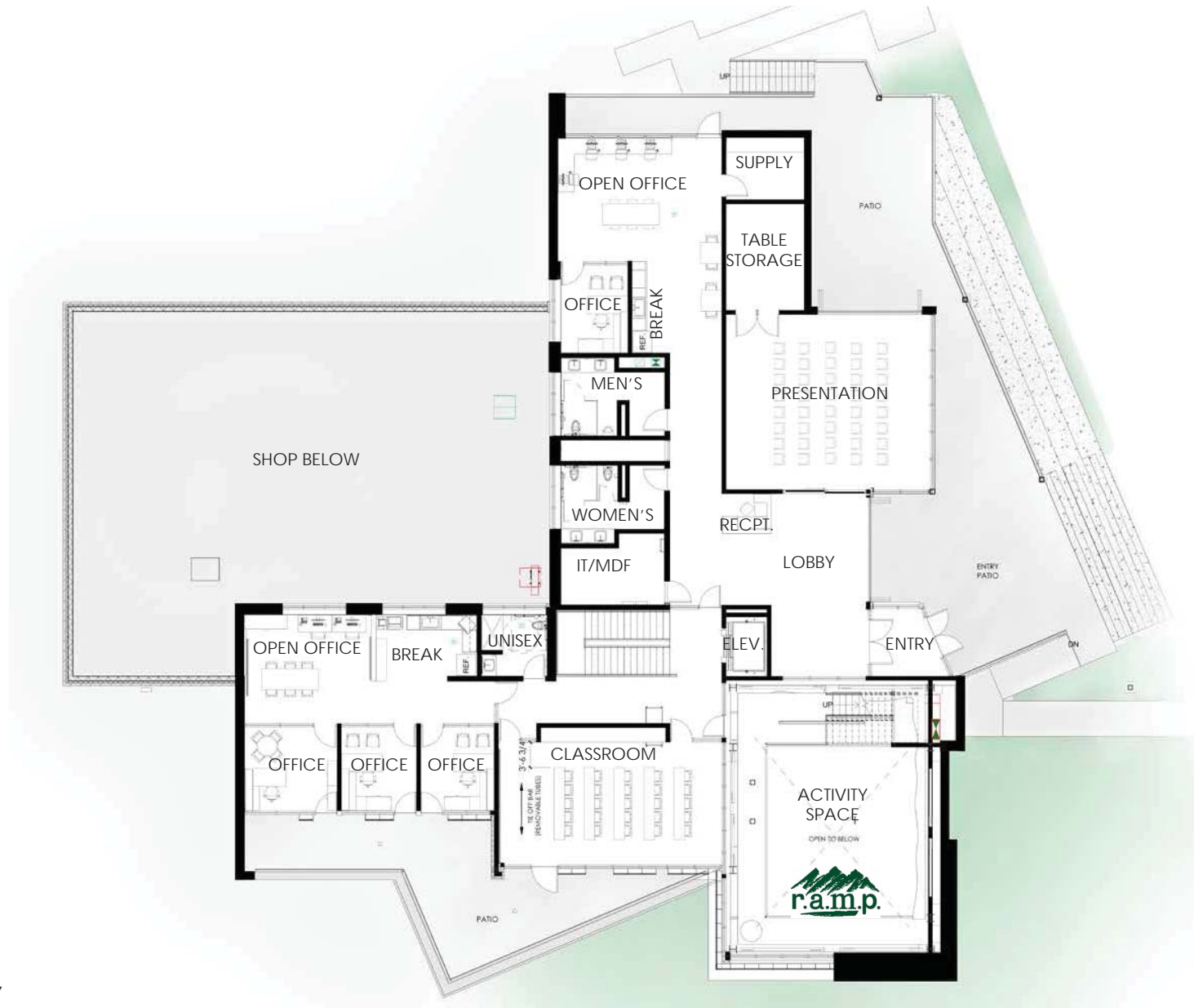
LEVEL 2 WEBER STATE UNIVERSITY