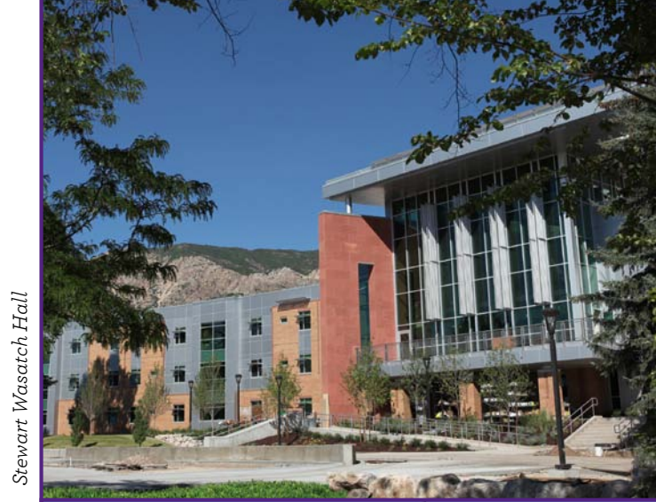
Stewart Wasatch Hall

In addition to academic space, the new building will include a student union area, a large food court, a fitness area with classrooms, an area devoted to cardio and weight training, lockers and showers, and event space.