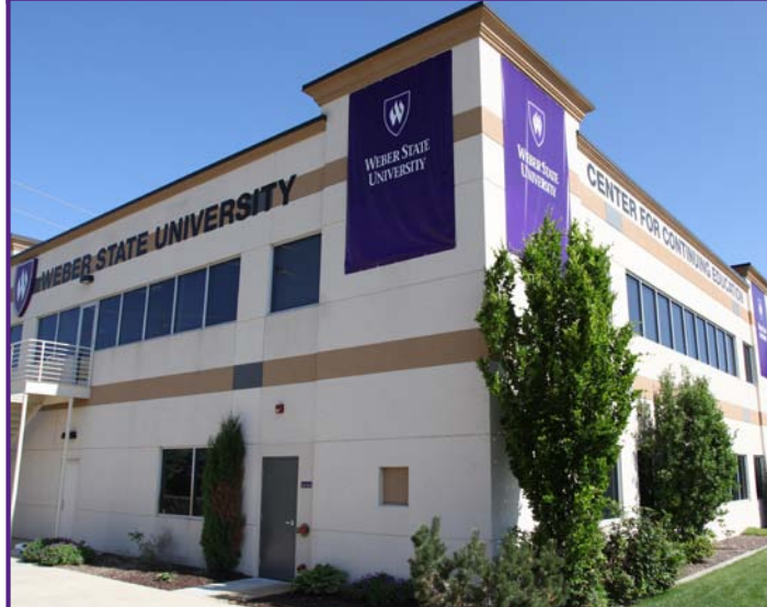
Center for Continuing Education