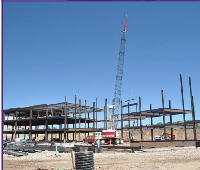
Professional Programs Classrooms Building