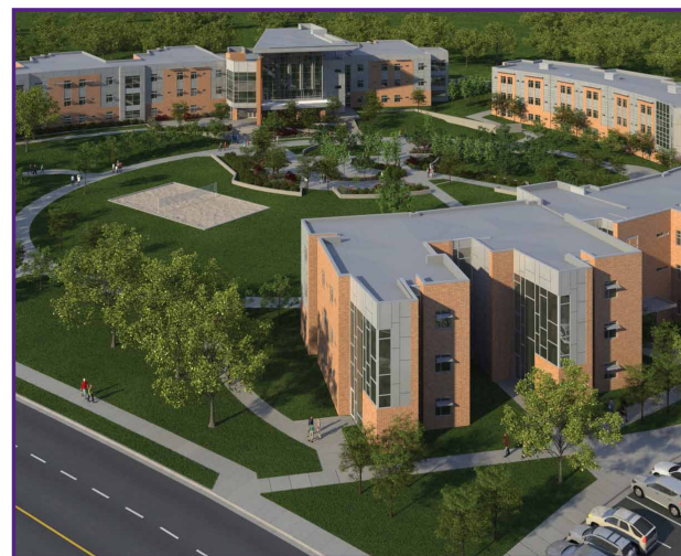
Artist rendering of student-life housing complex

The area from the Dee Events Center to the Stewart Stadium has two other major renovation projects: landscaping for the new student-life housing complex and rejuvenating the area around the tennis courts.