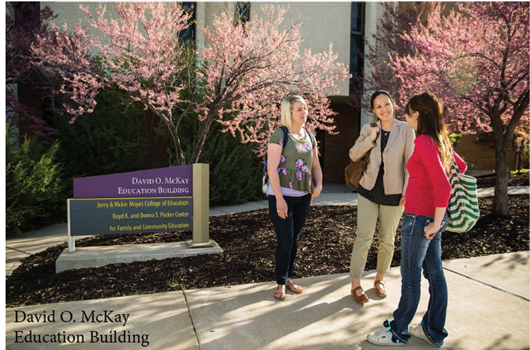
David O. McKay Education Building