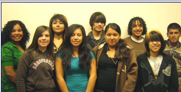
And best of all we have added 9 new students to Upward Bound. Welcome—it just keeps getting better.