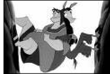
"BRING IT ON!"

Saturday, Jan 27 8:30 Check out of Hotel 9:00 Activity 12:00 Lunch 2:00 Leave for home If you need to contact your student