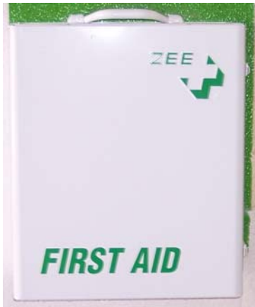
First Aid Supplies