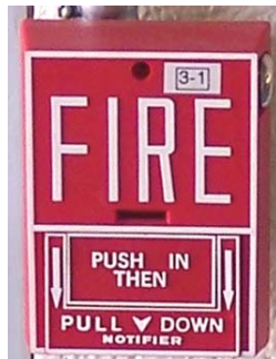
Fire Alarm Pull Handle