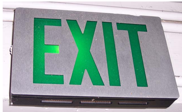
Emergency Exit (Outdoors)