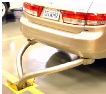
Exhaust Removal System