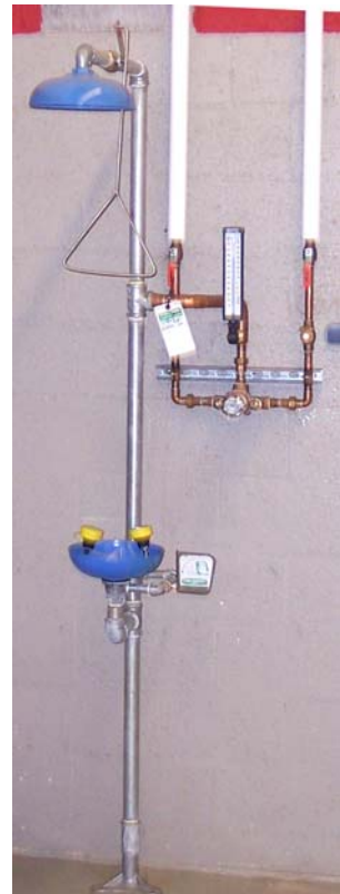
Emergency Shower and Eye Wash